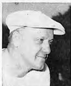
George S. Halas